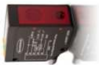
LE550 Laser Measurement Sensor